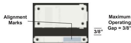
Figure 2. ELK-6021 Mounting Gap and Alignment