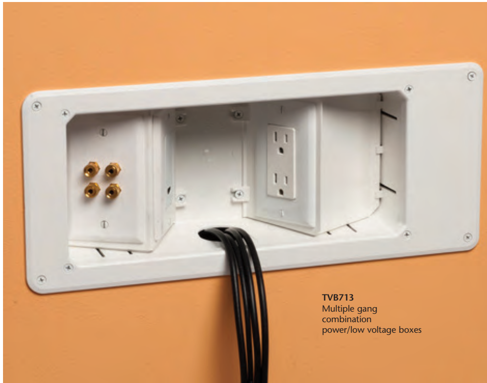
TVB713 Multiple gang combination power/low voltage boxes

For use with close-clearance TV mounting hardware