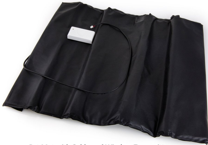
Pet Mat with Cable and Wireless Transmitter