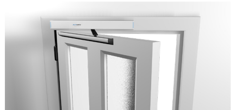
Pull Arm Setup