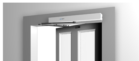
Pull Arm Door Setup