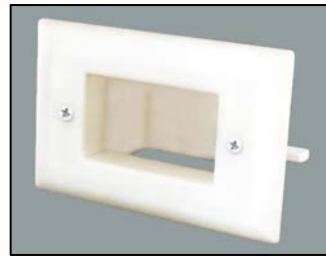
Easy Mount Plate Front View