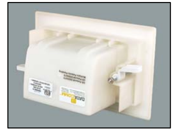
Easy Mount Plate Back View