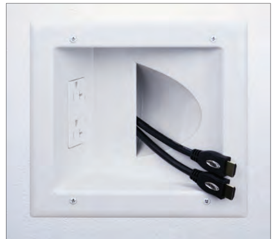
Final Installation with Compatible Wall Plate (Part #45-0031-WH)