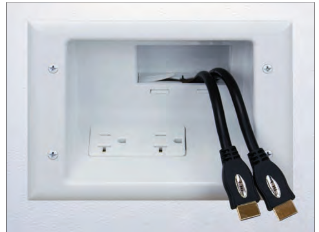
Final Installation with Compatible Wall Plate (Part #45-0071-WH)