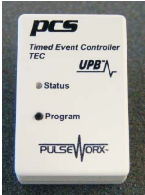
Timed Event Controller

The Timed Event Controller (TEC) is an integral part of the PCS UPB™ Pulseworx Lighting System .